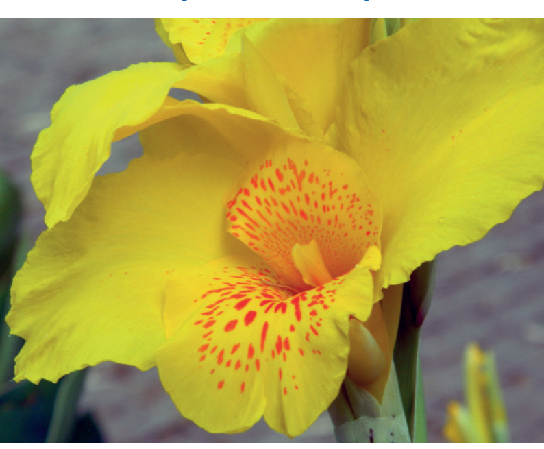
Canna x generalis

thought from the book "Collected Messages"